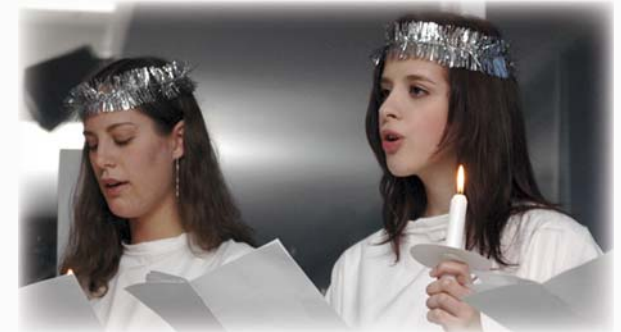
Lucia celebration at UBC.