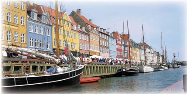
Nyhavn, Copenhagen, Denmark

Indeed, Scandinavia has a long and strong cultural tradition. We offer you an excellent opportunity to learn more.